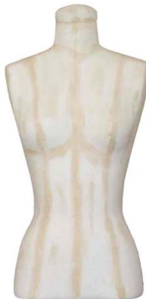
Antique Display Body Form