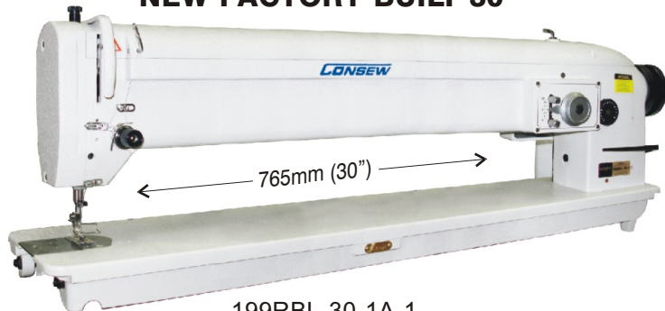
199RBL-30-1A-1 Special order (1A, 2A, 3A) Long arm with 30" work space