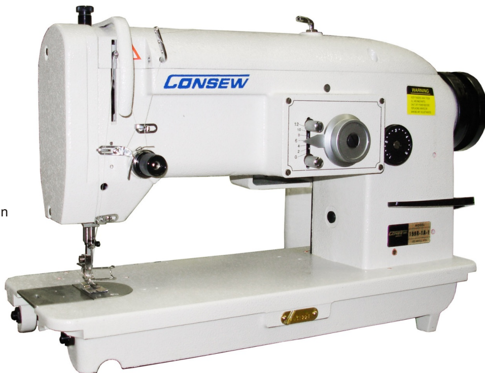
199RB-1A-1 Large Bobbin

COMBINATION ZIG-ZAG AND STRAIGHT STITCHER