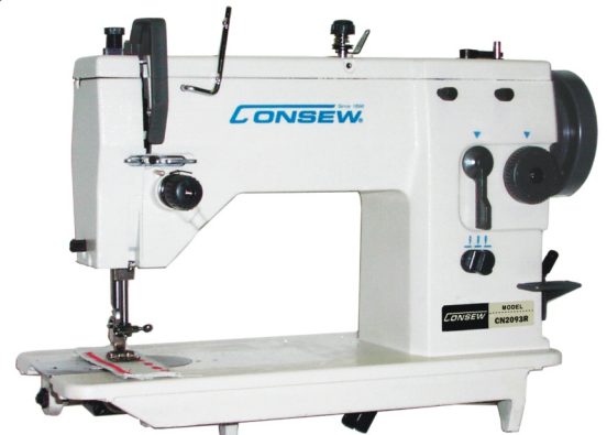
Also available is the traditional CN2093R NON-direct drive machine