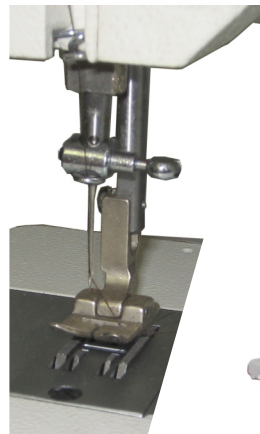
Closeup of needle adjusted to left position.

* Speed depends on width of zig-zag, material and thread.