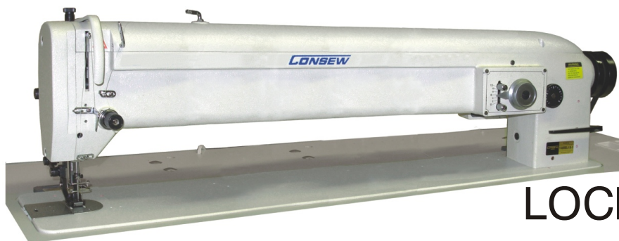
146RBL-30 30" Long Arm in 1A, 2A or 3A configuration (special order)

SINGLE NEEDLE DROP FEED WALKING FOOT ZIG-ZAG