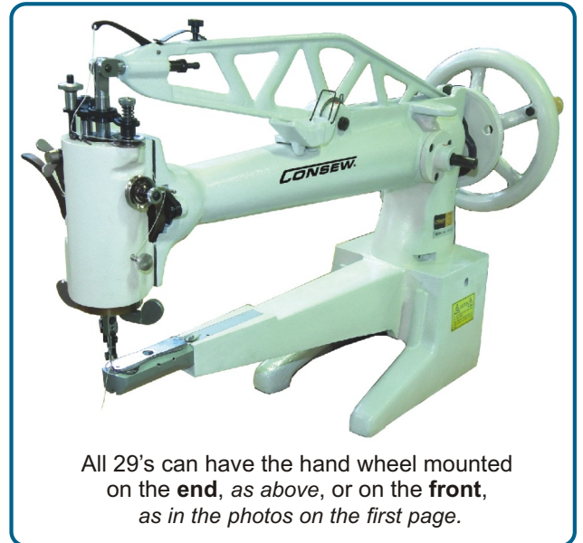
All 29's can have the hand wheel mounted on the end , as above, or on the front , as in the photos on the first page.